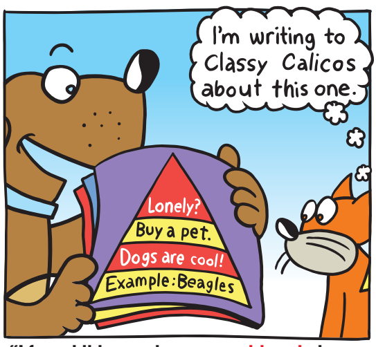
"I found this great summary triangle in my Beautiful Beagle Magazine."